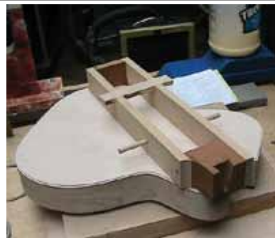
Chamber block with bracing used on both K161V Guitar and K162V Bass

The triple chamber interior construction coupled with the blade pickup give the Thin Twin and Electric Pro Bass that one of a kind sound. Enclosing the chamber creates a natural resonance that allows sustain without feedback in the guitar and that deep gutsy sound from the bass.