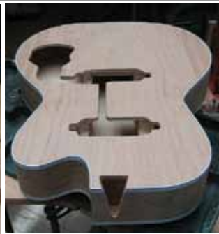
Raw KB161V Guitar before setting the dovetailed neck