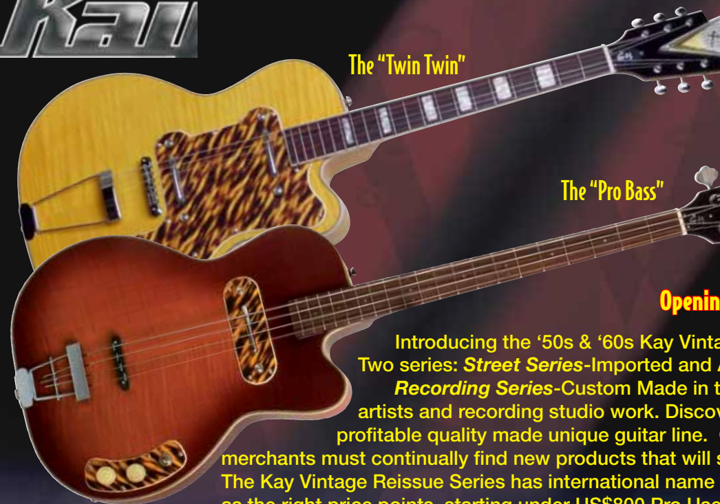
The "Twin Twin"