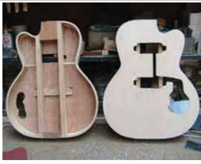
The "guts" of KB162V Bass (Left) The "Naked face" of KB161V Guitar (Right)

The K161 Kay Thin Twin electric guitar was originally introduced in 1952 and was known as the "Jimmy Reed" or "Howlin' Wolf" model. "T-Bone" Burnett played a Thin Twin with Robert Plant and Alison Krauss at the 2009 Grammy Awards. The Thin Twin was the first guitar that was able to create that unique Blues sound. The special Kay interior bracing made the instrument a favorite among Blues players as well as rockers of the '50s and '60s. The hand-wound pickups and separate center chamber allowed an extra biting natural distortion without feedback. The combination was a mellow clean gritty sound with natural sustain. The pickups are so hot that they needed to be contained in the center chamber, which is why the Twin Thin and Pro Bass made anyone who played it feel there was nothing else like it. The Pro Bass had a unique feature of a switch that cut off the high frequencies to reproduce an "upright Bass" sound but in the off position the Pro Bass gives a punchy Jazz sound. The Pro Bass comes with electric flatwound bass strings.