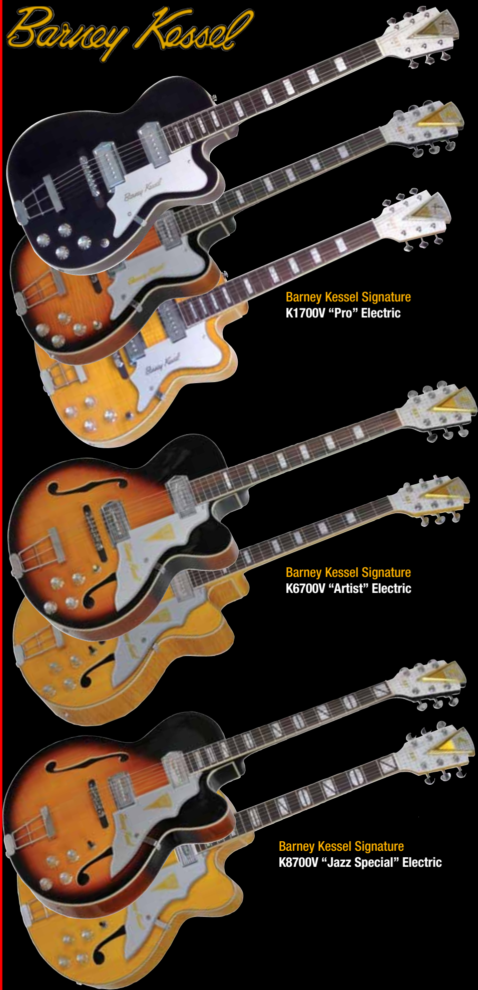
Barney Kessel Signature K1700V "Pro" Electric